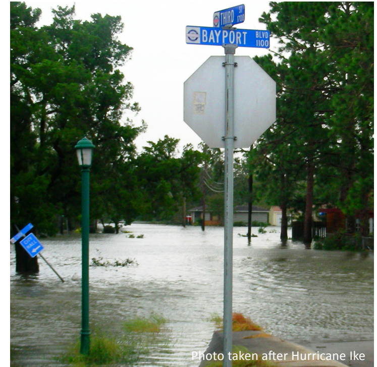
Photo taken after Hurricane Ike

All residents and businesses are encouraged to learn more about the flood map changes and may do so by visiting our website at www.seabrooktx.gov/flood . If you would like more information on how your specific property is impacted by updated maps, please contact Seabrook's Floodplain Administrator by calling (281) 291-5638 or emailing floodplain@seabrooktx.gov .