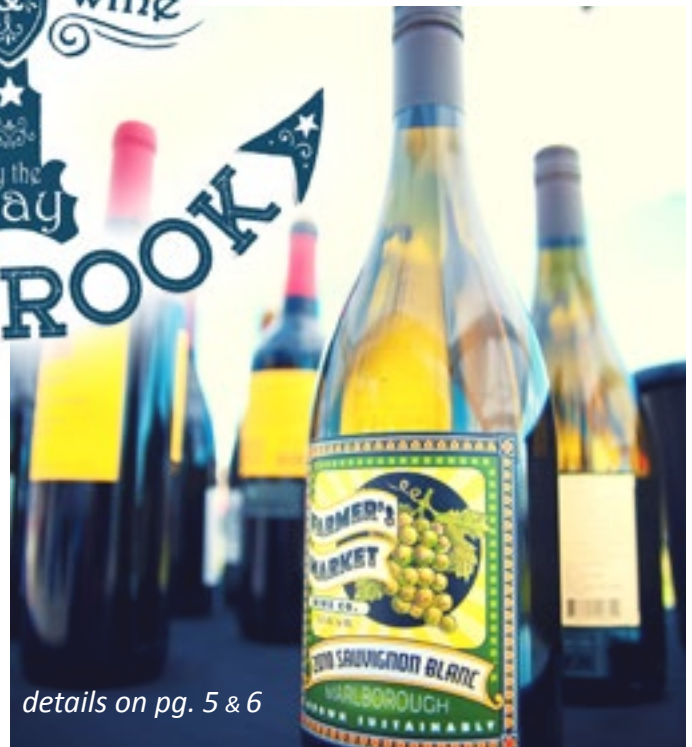
details on pg. 5 & 6